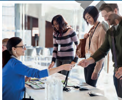
HOW DO YOU SPELL ...? p14