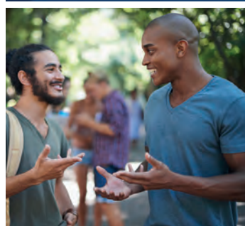
WHERE ARE YOU FROM? p8