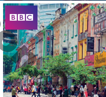
AROUND THE WORLD p16